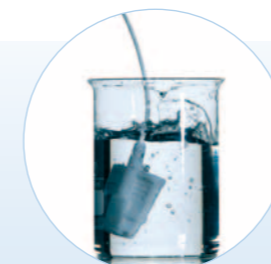
SoftCap® – Simple cleaning and disinfection