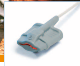
SoftCap® – Sensor for all finger sizes